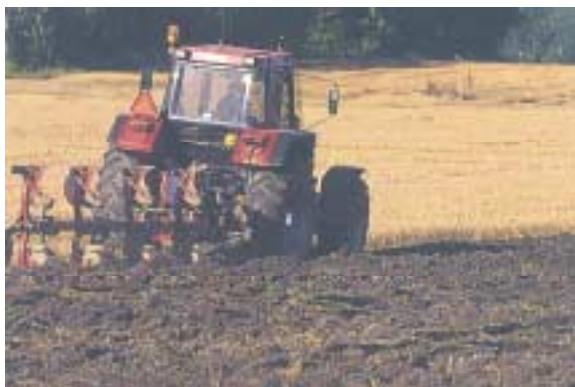
Fig. 2. Ploughing is even on the field, where a reversible plough was used.